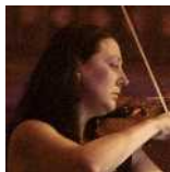
Vanía Batchvarova Violín